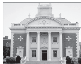
Warner Theatre, Worcester Academy

Wishing the New England Real Estate Community A New Year Sealed with the Very Best!