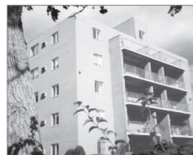
Camelot Apartments, Weymouth