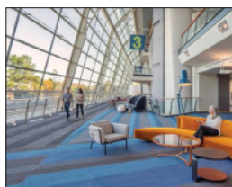
Corporate / Industrial / Lab