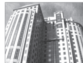
125 Summer Street, Boston