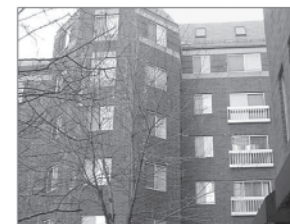
Bay Square Condominiums, Cambridge