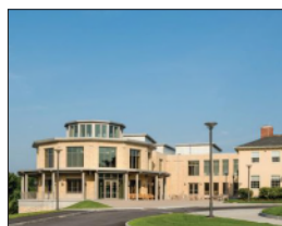
Academic / Cultural