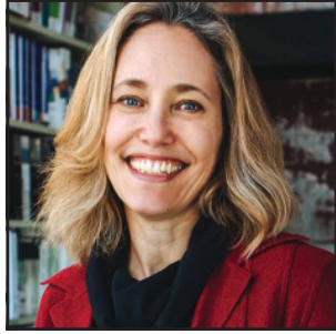
Kathleen Bartels LLB Architects

We sold a 2.6 acre residential development site on Main St. in Stratford, CT. The property is located in a transit-oriented district and sold for $1.15 million and will be developed to include an apartment complex.