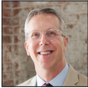
Drayton Fair LLB Architects

Successfully concluding the sale of a 44-unit development site after 8 years representing the owner.